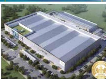
LEED Factory HVAC & Ventilation