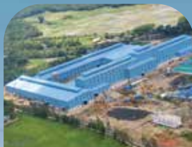
PHP Steel Plant