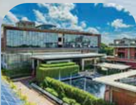
Columbia washing plant Ltd