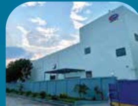
R - PAC