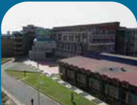
Square Textiles Ltd