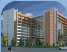
BGMEA University of Fashion & Technology