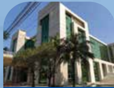
Sher-e-Bangla Agricultural University