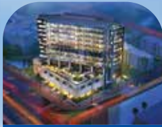
JCX Business Tower