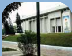
Osmani Memorial Auditorium